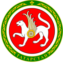
Republic of Tatarstan