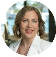
Tytti Yli-Viikari Auditor General of Finland

The SDG framework as such gives a very good criteria also to audit progress. And one of the issues that we can see is that now, with this pandemic crisis, there is a big risk that governments throughout the world do not keep on track and do not step up their efforts to actually fulfill what they had in mind for the roadmap to 2030. And auditors can be in transparency, can make it public openly what is the track record of the government, in which issues they are excellent, what is going well and which issues they are lagging behind. And sometimes also shading lights on what is behind the policy making and what are the real impacts of the policy. So, I think auditors can add value to that public debate. And the SDGs and the Agenda 2030 on the sustainability is about leaving no one behind. It's about integrating different people and different groups' interests in the length of the policymaking. It's about making sure that the future generations are not forgotten when we make political decisions today. And I think auditors can help to see what is really happening, what steps are being taken today, and what we should be more careful with or more worried about.