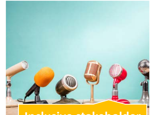
Inclusive stakeholder engagement