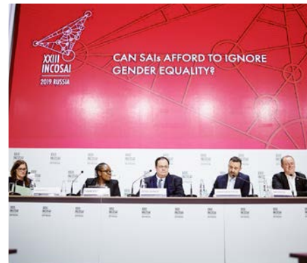
Advocacy for gender & inclusiveness