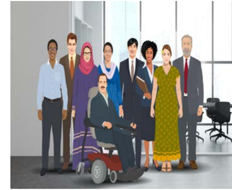
Mainstreaming gender & inclusiveness