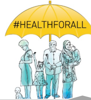
Inclusive audit impact