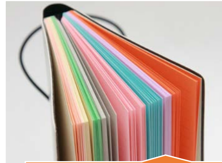
Inclusive audit portfolio