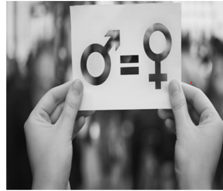
IDI Gender Strategy