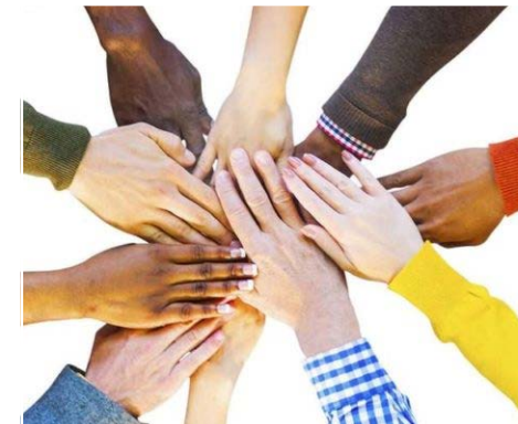
Partnering for inclusiveness