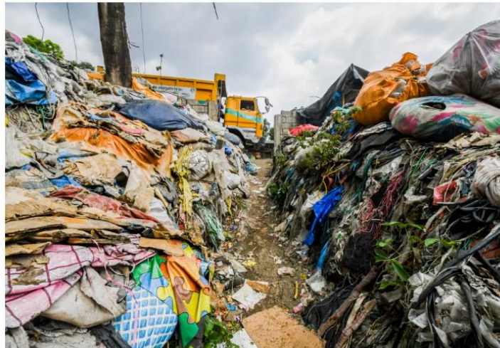
Heaps of garbage remain outside a landfill in Barangay San Isidro in Rodriguez, Rizal.