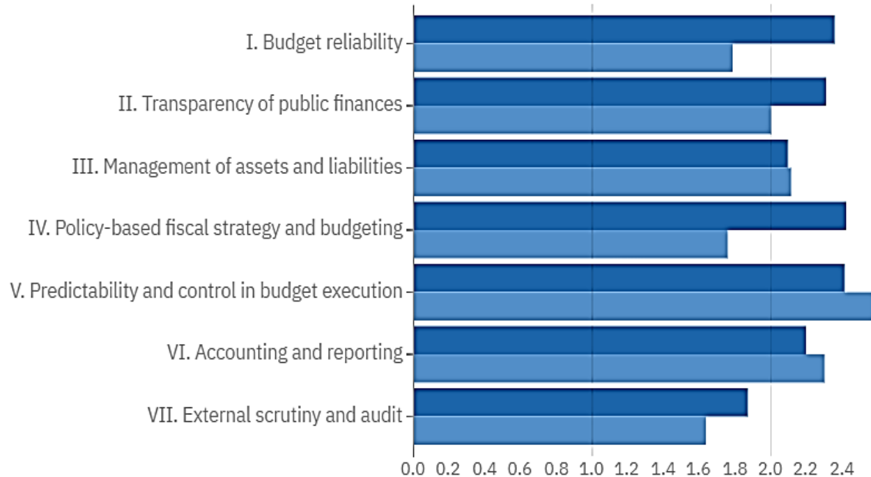
AVERAGE PERFORMANCE BY AREAS OF PFM