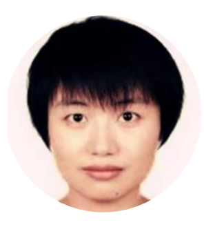
Xia Shiyuan Principal Consultant of Audit Research Institute of the National Audit Office of the People's Republic of China

Section 1 Employment policies in China under COVID-19